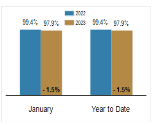
Average Days on Market Until Sale