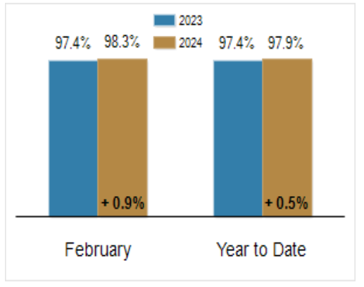
Activity: Year to Date